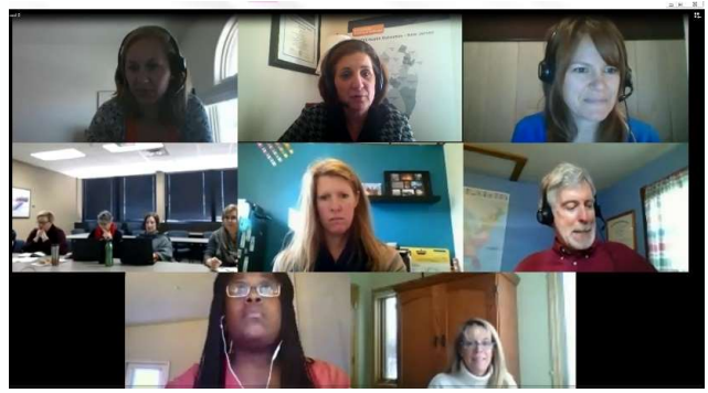
Webinar Discussion Group