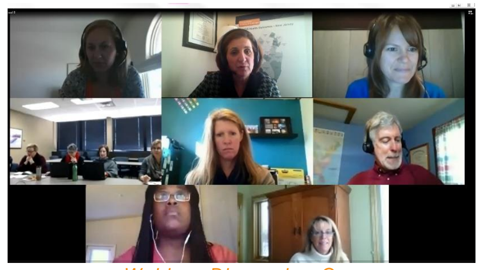
Webinar Discussion Group