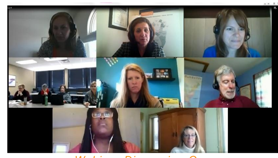
Webinar Discussion Group