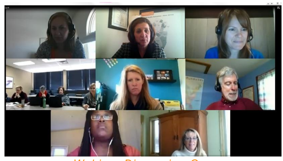
Webinar Discussion Group