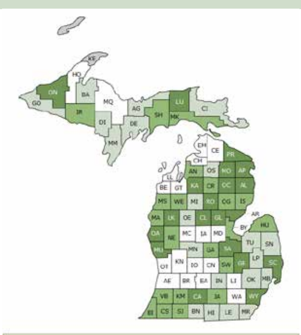
Rank 1-20 Rank 21-41 Rank 42-62 Rank 63-82 Not Ranked