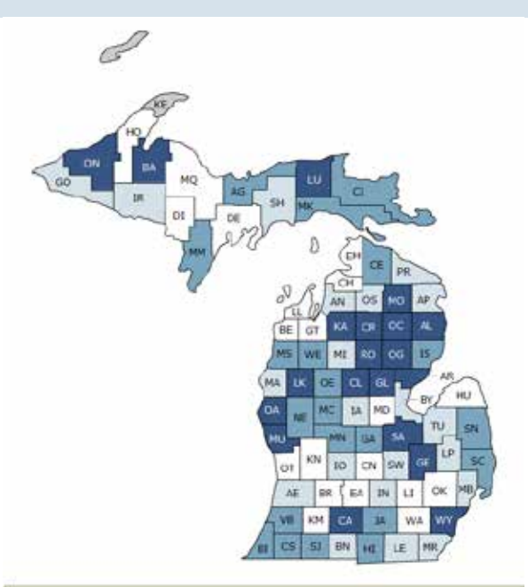
Rank 1-20 Rank 21-41 Rank 42-62 Rank 63-82 Not Ranked

Lighter colors indicate better performance in the respective summary rankings. Detailed information on the underlying measures is available on our web site.